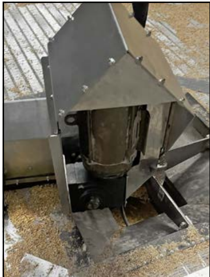
Center Pivot, Motor and Sump closeup