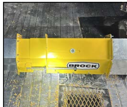
Tensioner/Extender (Patent Pending)