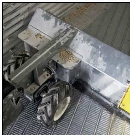
Tractor Drive -not driven by an exterior motor.