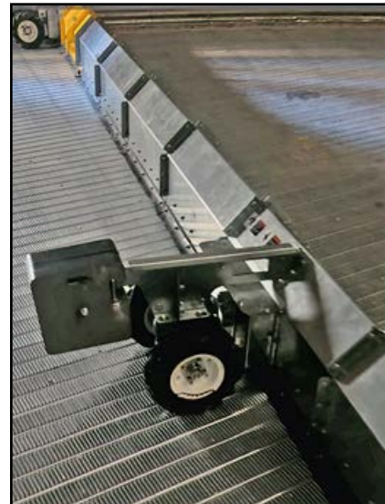
Middle Drive Unit with Weights