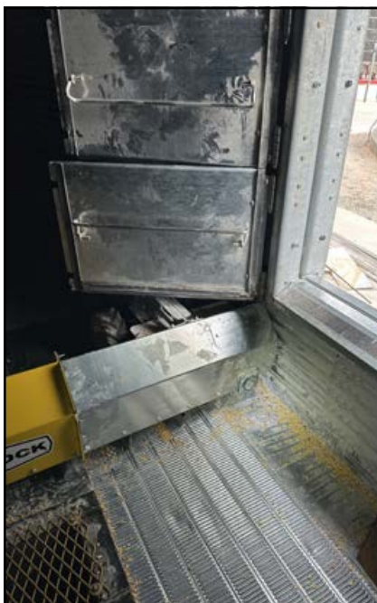
Moves More Grain From Bin Edges for a More Thorough Cleanout