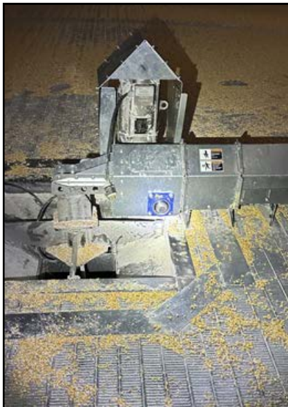
Center Pivot, Motor and Sump