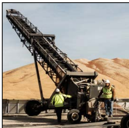
Brock's LeMar® Transport Conveyor can pile grain to 38 feet (11.5 m) peak height and reach the middle of a 150-foot (45.7-m) wide bunker.

A long-lasting, slider bed belt design improves capacity, and 16-foot