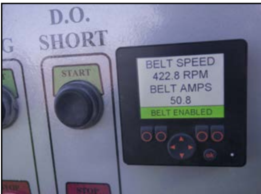
Transport Conveyor Belt Slippage Monitoring