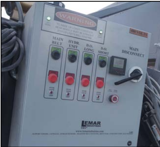
LeMar® Transport Conveyor Control Panel