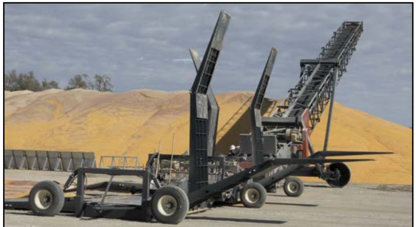
Drive-over unloading conveyors are available in single or double (shown) drive-over configurations