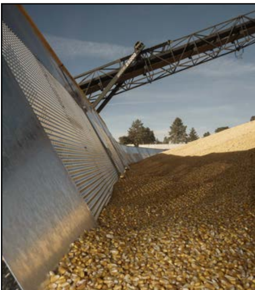
Safeguard your grain with Brock's Temporary Storage Aeration Wall