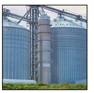
Drying & Conditioning