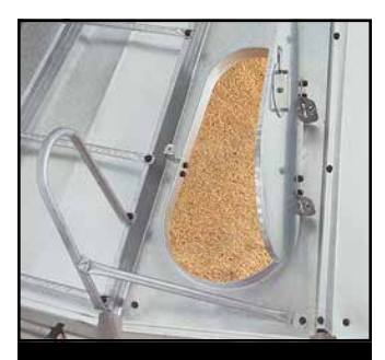
Ob-round Manhole combines the strength of a round manhole design with the easier-to-enter/exit oblong shape. The cover features heavy hinges and a durable rotating latch.