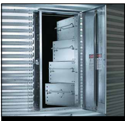
LATCH-LOCK® Walk-Through Bin Entry Doors offer simple yet safe access, with a one-piece outer door and four interlocking inner panels that open in sequence from top to bottom with a lift of a latch.