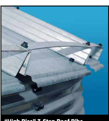
"High Rise" 3-Step Roof Ribs paired with the innovative Eave Tension Straps provide unsurpassed durability and the highest peak load capacities available.

For growers storing their own grain, Brock's grain storage bins continue to be the first choice for safeguarding their crops. Brock Solid delivers. Always has, always will.