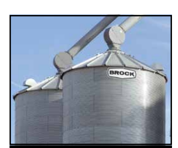
A Grain Bin-style Roof with a higher load rating is standard on larger diameter hopper bin models; an economical feed bin-style roof is standard for smaller models.