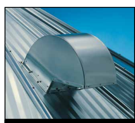
Gravity Roof Ventilators are available in both elbow and round mushroom styles to help ensure free air movement throughout the bin.