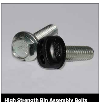
High Strength Bin Assembly Bolts are a Grade 8, with JS1000™ coating for superior weather- and corrosion-resistance. The JS1000 trademark is not owned or licensed by CTB.