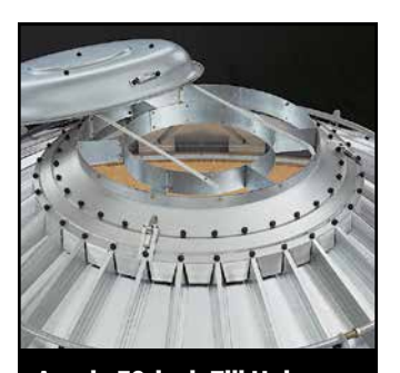
Ample 39-inch Fill Hole (991 mm) is reinforced with a rigid 24-inch (610-mm) diameter center ring for extra strength and to accommodate most auxiliary equipment.

Roof Peak Capacity Range: 3,000-10,000 pounds (1,360-4,536 kg)