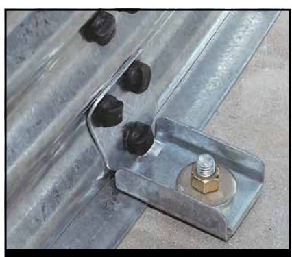
Bin Anchor System helps create a strong, weather-tight connection to the foundation, protecting your investment from winds up to 90 mph (145 kph).