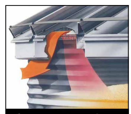
Unique Eave-Vent System raises the roof off the sidewalls to create ample ventilation around the entire circumference of the bin. The result is more air circulation while eliminating roof cuts, all at a lower cost than rooftop ventilation options.