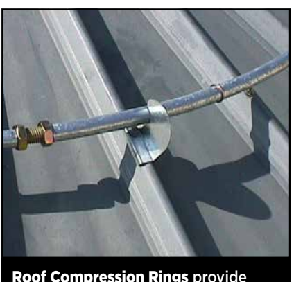
Roof Compression Rings provide additional structural support and another level of safety for those working on top of the bin.