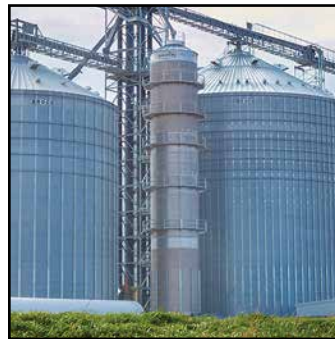
Drying & Conditioning