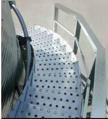
The wide, sturdy steps of BROCK SHUR-STEP® Stairs feature raised perforations forming a non-skid surface, are fabricated from galvanized steel for long-lasting service and designed to meet or exceed relevant OSHA standards when installed properly.

BROCK SHUR-STEP Bin Stairs - another reason more people are making their next bin Brock!