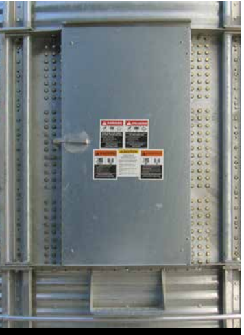
Brock's LATCH-LOCK® Walk- Through Entrance Door for Stiffened Bins.