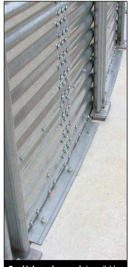
Brock's heavy base angle is available to match bin configurations of twoor three-stiffeners per sidewall body sheet.