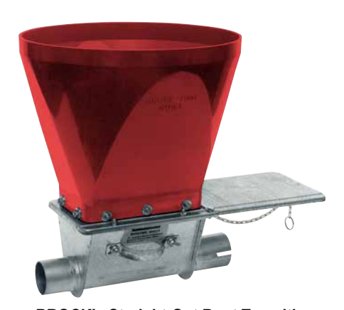
BROCK's Straight-Out Boot Transition