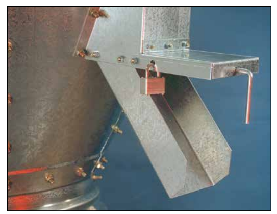
Add a lock to prevent accidental discharge.

Brock's unique Hopper Valve Kit gives an alternate way to easily get small amounts of feed or other stored materials out of a hopper-bottom bin or silo. This easy access is important when a small quantity of the stored material is needed at a location not serviced by the auger system.