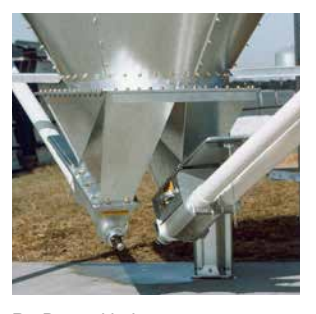
B - Boot with three auger systems servicing two buildings (Model 75 FLEX-AUGER® shown.)