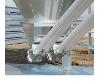
A - Boot with four auger systems servicing one building (Model 90 FLEX-AUGER® shown.)